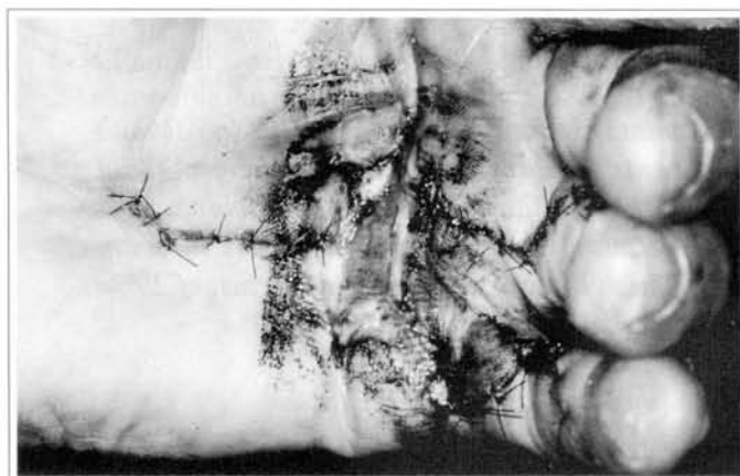
Fig. 5 - Fifteen days, postoperative.