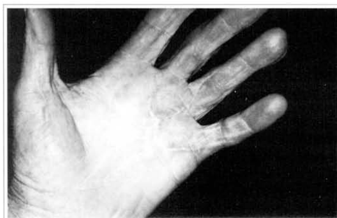
Fig. 6 - Complete scar healing, small extension deficit of little finger.