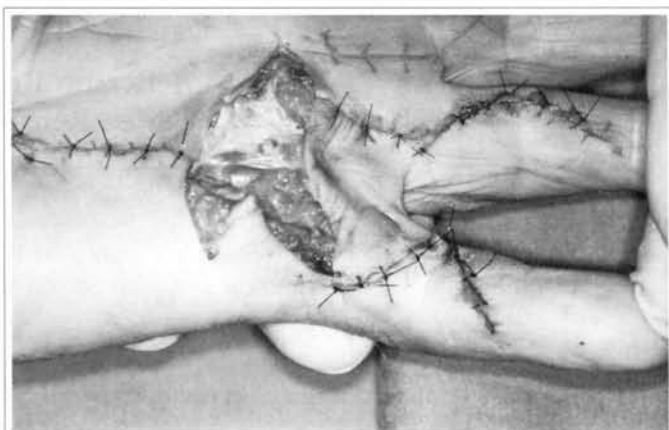
Fig. 2 - Transoperative period, showing loss of skin substance using the open palm technique, complete finger extension.