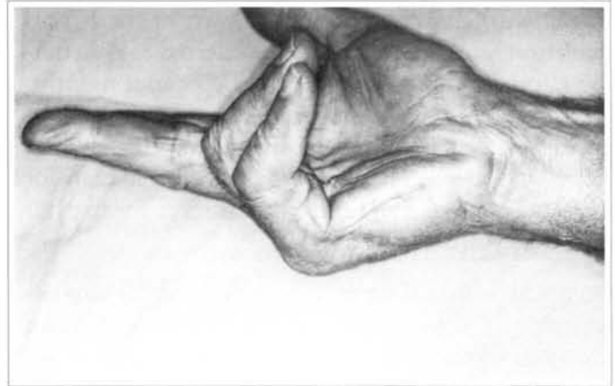
Fig. 7 – Contracture in ring and little fingers.

plastered splint in the intrinsic plus position (wrist in flexion of 30°, MP in flexion of 70° to 90°, PIJ and DIJ at 0° of extension) was maintained for 15 days, and total digital movement freedom was permitted after this period. All patients were submitted to Weber's test (static sensitive discrimination of two points) in the sixth postoperative month.