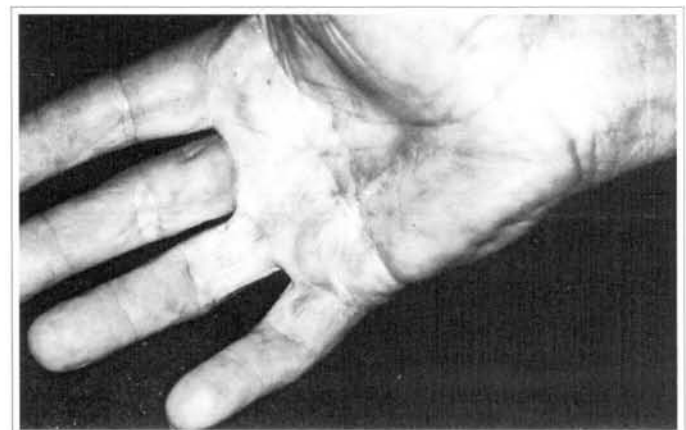
Fig. 9 – Full extension, with minor deficit of little finger.