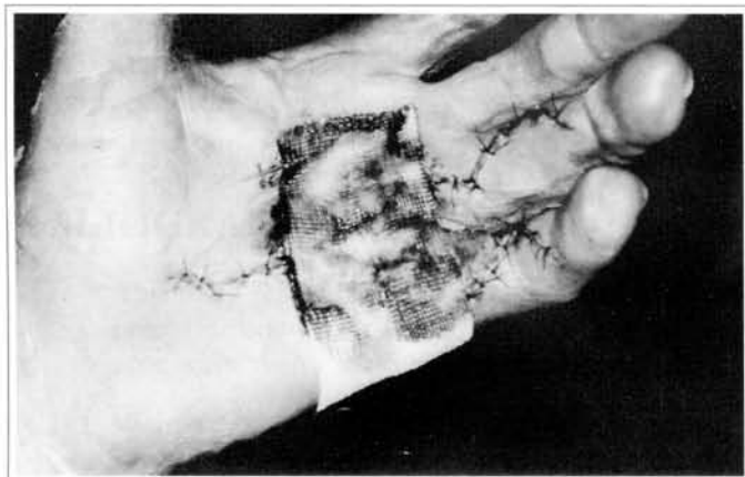
Fig. 3 - Five days, postoperative.