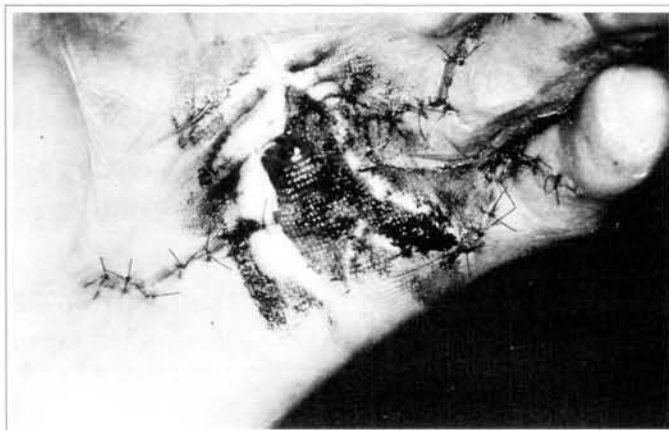
Fig. 4 - Ten days, postoperative.