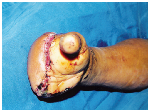
Figure 3 – Transmetacarpal amputation covered with a lateral arm flap in a victim of an electric burn.

Microsurgical flaps are indicated for complex reconstructions in burn patients, especially when the lesions involve noble structures and joints. Clearly, this is an exceptional procedure adopted only when simpler techniques,