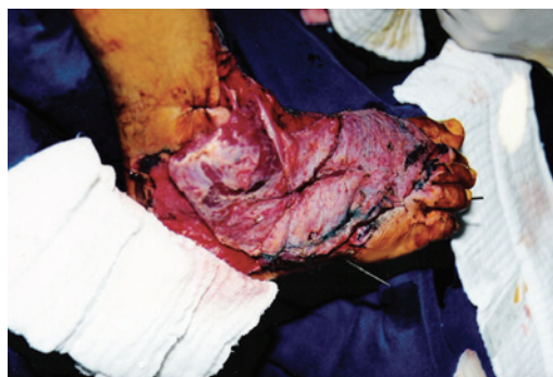
Figure 4 – Dorsum of the foot and ankle covered with a latissimus dorsi flap.