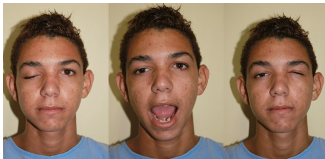
Figure 1. The Marcus Gunn syndrome. Patient at rest (left). Eyelid opening on opening the mouth (center). Eyelid opening on contralateral eye closure (right).