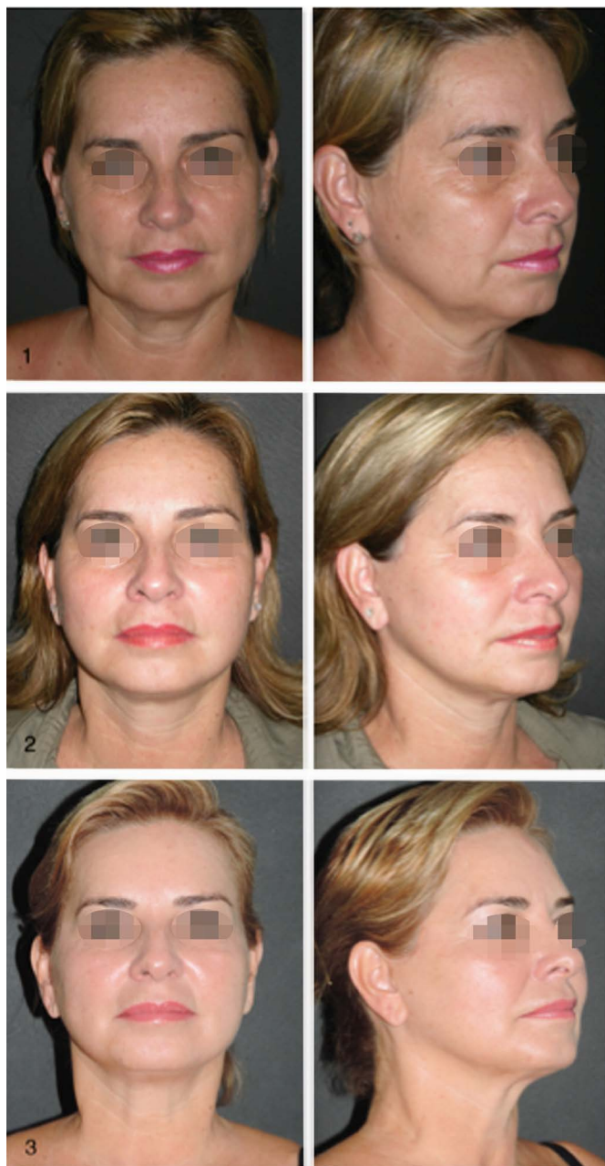
Figure 3. Satisfactory result. 1. Preoperative. 2. Postoperative period of 1 year. 3. Postoperative period of 7 years.