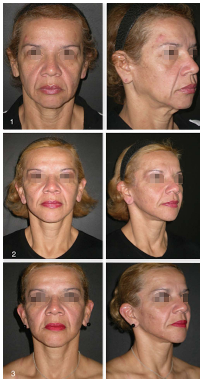
Figure 2. Excellent results. 1. Preoperative. 2. Postoperative period of 1 year. 3. Postoperative period of 7 years.

The history of treatment of the cervical region shows us the contribution of various pioneering authors in refinements of the skin, platysma, SMAS, and adipose tissue. Millard et al. 11 in 1968, with the cervical lipectomy; Guerrero-Santos 2 in 1974, with muscular flaps traction toward the mastoid; Peterson 12 in 1978, with sections and lateral tractions of the platysmal muscle; Aston and Kaye 4,5 in 1981, with medial and lateral sections of the platysma muscle; Connell 3 in 1983, with the total sectioning of the platysma muscle;