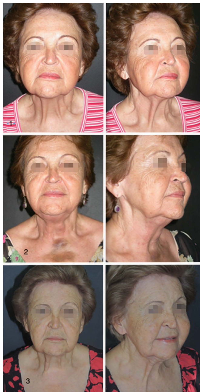
Figure 4. Unsatisfactory outcome. 1. Preoperative. 2. Postoperative period of 1 year. 3. Postoperative period of 7 years.

the jaw is achieved. The lower third of the neck, when tense, full and defining the entire sternocleidomastoid, is a characteristic of desirable beauty, accepted universally 14 .