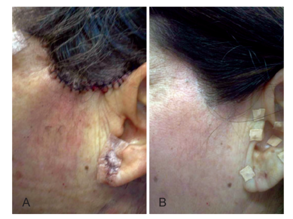
Figure 4 – In A, final suture with single stitches performed with 4-0 non-absorbable thread. In B, six months after surgery.

Figures 6 to 10 illustrate some patients of this series.