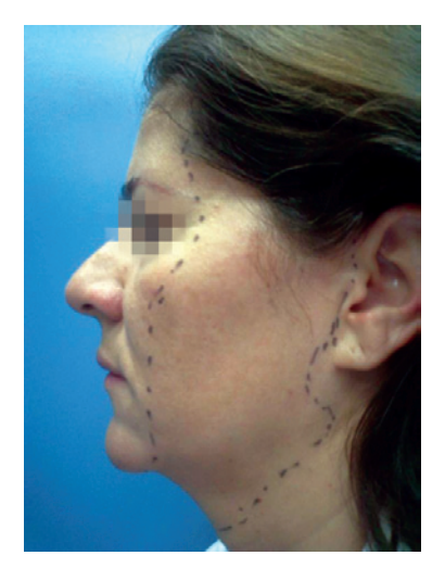
Figure 2 – Patient profile, with skin demarcation, delimited in the area of dissection of the temporal region, on the entire face, going from the anterior ear line up to 1 cm from the outer eyelid corner, to then move down to the outer corners of the nasolabial fold, mandibular line, and neck until reaching – and even up to 1.5 cm below – the hyoid bone.

Liposuction, fat graft, laser treatment, chemical peeling, forehead treatment, and blepharoplasty, in addition to other non-surgical procedures, were selectively combined in the same or separate surgeries.