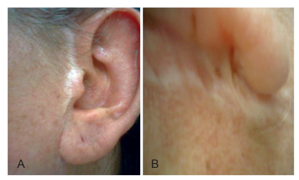
Figure 1 – Types of scar ruptures frequently found in late postoperative rhytidoplasties, which already evolve into complications when they are noted. In A, preauricular scar. In B, retroauricular scar.

To diminish the inconveniences of periauricular scars and frequent hair loss and in order to apply the technique to patients of different age groups, rhytidoplasty without preauricular and retroauricular incisions was performed using 2 surgical access points: the hairline on the temporal