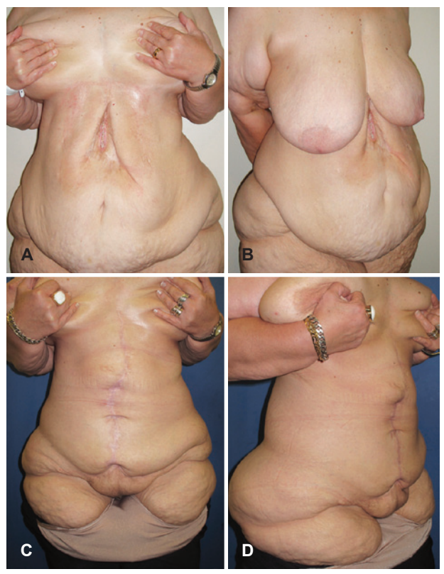
Figure 7 – In A and B, preoperative appearance, in frontal and side views, respectively. In C and D, postoperative appearance 6 months after vertical abdominoplasty, in frontal and side views, respectively. This patient showed chronic exposure of mesh used to correct an incisional hernia. The mesh was removed and the hernia was corrected by plication of the abdominal wall.

448 Rev Bras Cir Plást. 2012;27(3):445-9