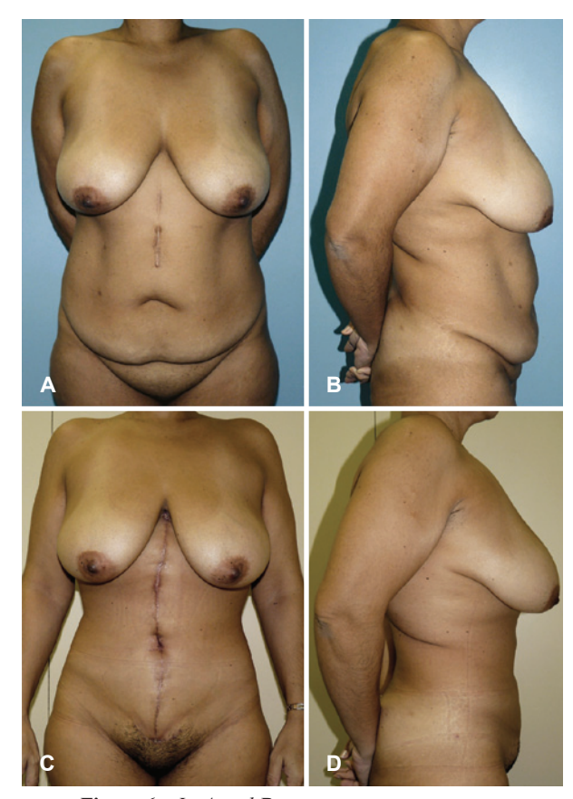
Figure 6 – In A and B, preoperative appearance, in frontal and side views, respectively. In C and D, postoperative appearance 6 months after vertical abdominoplasty, frontal and side views.

The difficulty in objectively evaluating the results of plastic surgery is well known, because the esthetic component of surgery is the main aim sought by patients. Although we did not have the opportunity to analyze the results with a greater degree of evidence in the present study, for example the use of a standardized scale to assess the evaluations made by independent observers<sup>9</sup>, we asked the patients to describe their satisfaction on a scale of 0 to 10 (subjective data). The degree of satisfaction was high, with 67% of the patients