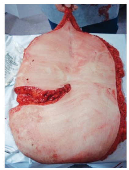
Figure 3 – Surgically excised piece.

All patients underwent significant weight loss after bariatric surgery, with an average loss of 39% of their initial