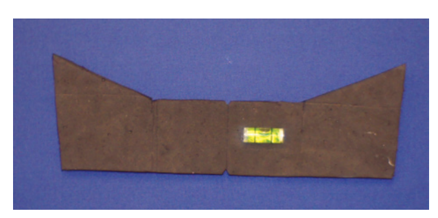
Figure 1 – Original preoperative marking template.

In addition, the template has 2 central marks that allow for alignment with the vulva and the umbilicus, further improving the positioning and symmetry of the resultant marking.