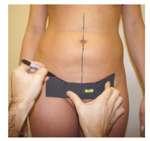
Figure 3 – Marking performed during the preoperative period of the abdominoplasty using the proposed template and a dermographic pen.