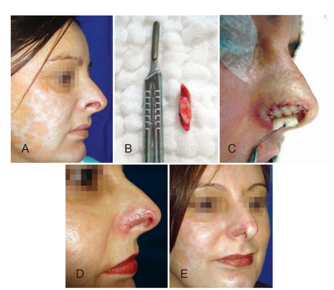
Figure 1 – Case 1. In A, preoperative appearance of a post-burn sequela. In B, composite skin and auricular cartilage graft. In C, intraoperative appearance. In D, appearance at 30 days after surgery. In E, appearance at 6 months after surgery.

In this article, we describe 3 patients presenting with nasal alar post-traumatic sequelae, 2 of which were caused by human bites, and their surgical reconstruction using composite skin and auricular cartilage grafts. The lack of scientific articles regarding the avulsion of nasal tissue and its etiology encouraged us to perform this study.