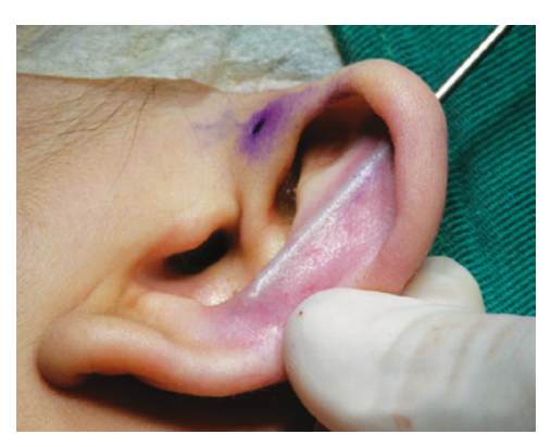
Figure 3 – Passage of the crochet needle through the narrow subcutaneous tunnels of the external ear surface.