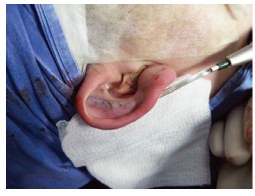
Figure 5 – Perioperative demonstration of definition of ante-helical fold by anterior scarring with rasp.

The dressing was performed using damp cotton molded to the depressions and grooves of the ear, gauze, cap-shaped dressing, and bandage, which were removed on the second postoperative day. After removal of the dressing, the patients wore a noncompressive elastic bandage for 15 consecutive days and then only at night for 60 days. The suture of the retroauricular skin was removed on postoperative day 14. The patients were followed up as outpatients, with visits scheduled on postoperative days 7, 14, 30, 90, and 180. They were discharged from follow-up 12 months