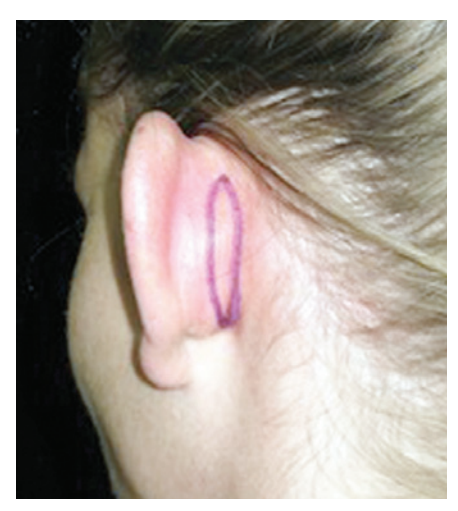
Figure 1 – Surgical marking of a conservative retroauricular fusiform skin resection after simulation of ear rotation.

The surgical procedure was initiated with local antisepsis using a chlorhexidine aqueous solution. The hair was prepared using cap-shaped sterile fields and micropore for patients with long and very thin hair (Figure 2), as well as an ear plug for ear canal protection. Then, anesthetic blockade of the main nerve branches of the ear and infiltration of the mastoid area, posterior auricular surface, and antihelix were performed using a 10-mL solution of 2% lidocaine with adrenaline and 10 mL of ropivacaine at 10 mg/mL. Approximately 6 mL of solution was used in each ear. Local blockade and general anesthesia were performed concomitantly in pediatric patients and patients who were undergoing combined