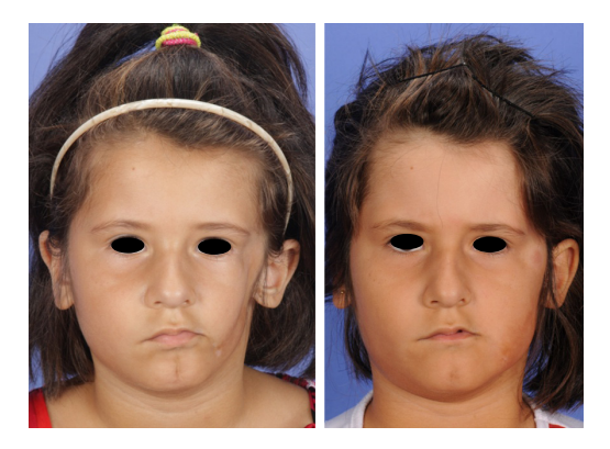
Figure 2 – (Left) Pre-surgical frontal photographs of a 6-year-old type II Parry-Romberg syndrome patient (Table 2, Patient J). (Right) Post-surgical frontal photograph of the same patient, three years after initial hemifacial (left) free-fat inclusion surgery.

Figure 1 – (Above, left) Pre-surgical frontal photographs of a three--year-old type I Parry-Romberg syndrome patient showing early manifestations of the disease (Table 2, patient D). (Above, right) Frontal photograph of the same patient, two years later, showing the slow progression of the disease in this case. (Below, left) At seven years of age, the patient underwent hemifacial free-fat inclusion and otoplasty for correction of his prominent ears. (Below, right) Two years after the surgery, the patient had a satisfactory esthetic result, with maintenance of the volume in the right hemiface and without any signs of recurrent ear deformity.