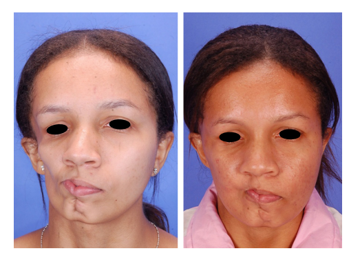
Figure 5 - (Left) Pre-surgical oblique photograph of the same patient as in Figure 4. The severe facial atrophy can be observed. (Right) Post-surgical oblique photograph of the same patient showing significant improvement of the facial atrophy.