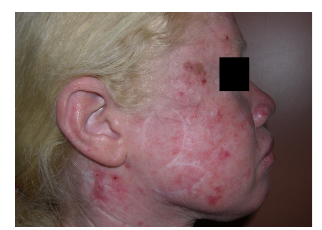
Figure 3. Long-term post-operative outcome of a bilobed flap on the right hemiface

lateral thigh (ALT) microsurgical flaps (12%). The size of the lesions were divided into those \le 4 cm (80.20%) and > 4 cm (19.80%). The demographics of the cases studied are summarized in Table 1. One death occurred owing to vascular invasion in the common carotid with BCC, leading to profuse bleeding in a 23-year-old patient. An example of long-term outcome is shown in Figure 3.