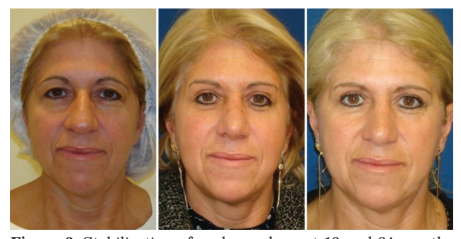
Figure 3. Stabilization of eyebrow descent 12 and 24 months after surgery.

There was a small drop in eyebrow elevation measurements in this study between 1 and 6 months after surgery. This downward trend had stabilized in subsequent follow-ups (12 and 24 months) (Figure 3). These observations suggest that the initial decline may be related to a loss of tensile strength of the Mononylon 3.0 suture while there is no fixation and the complete periosteal healing, preventing the progression of decline. These findings suggest that external fixation, regardless of method, should work, maintaining the elevation while the tissue heals in its new position. Experimental studies by Romo<sup>12</sup> suggested that this type of complete fixation requires around 6 weeks in animal models.