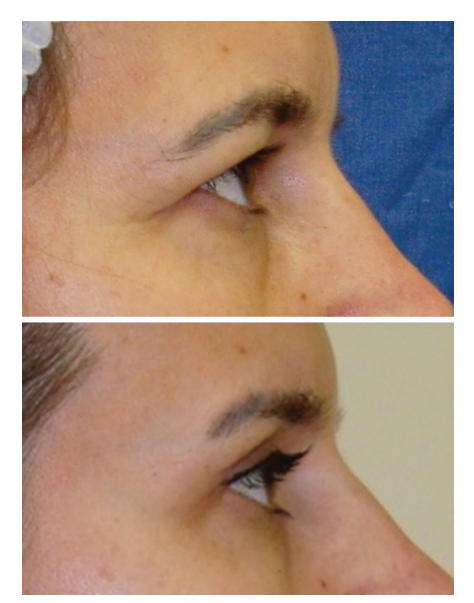
Figure 5. Results 6 months after performing the technique described by the authors.