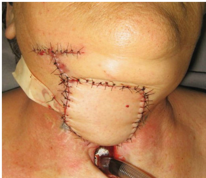
Figure 3. Final intraoperative aspect of the microsurgical reconstruction of the esophagocutaneous fistula.