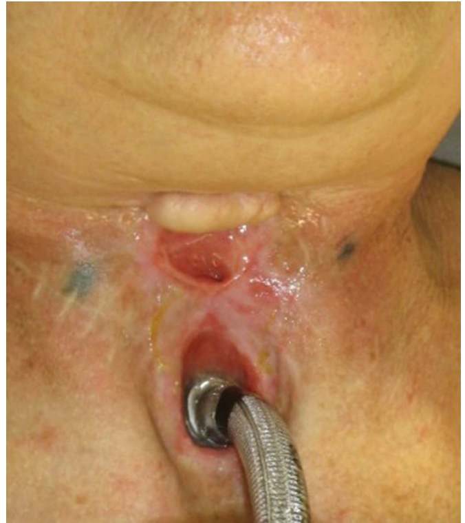
Figure 1. Initial clinical aspect of the esophagocutaneous fistula.

The team opted to implement a microsurgical ALT fasciocutaneous sandwich flap with half of the de-epidermized part used to reconstruct the anterior esophageal wall and the other half for reconstruction of the cervical skin portion (Figure 2). The patient