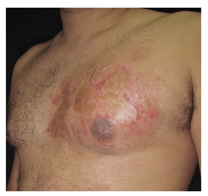
Figure 2. Postoperative aspect at 18 months after surgery.