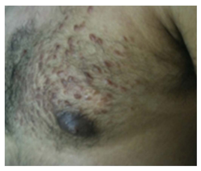
Figure 1. Preoperative aspect of the affected left chest region.

An excisional biopsy confirmed the diagnosis of CPL. The preoperative laboratory examination produced normal results.