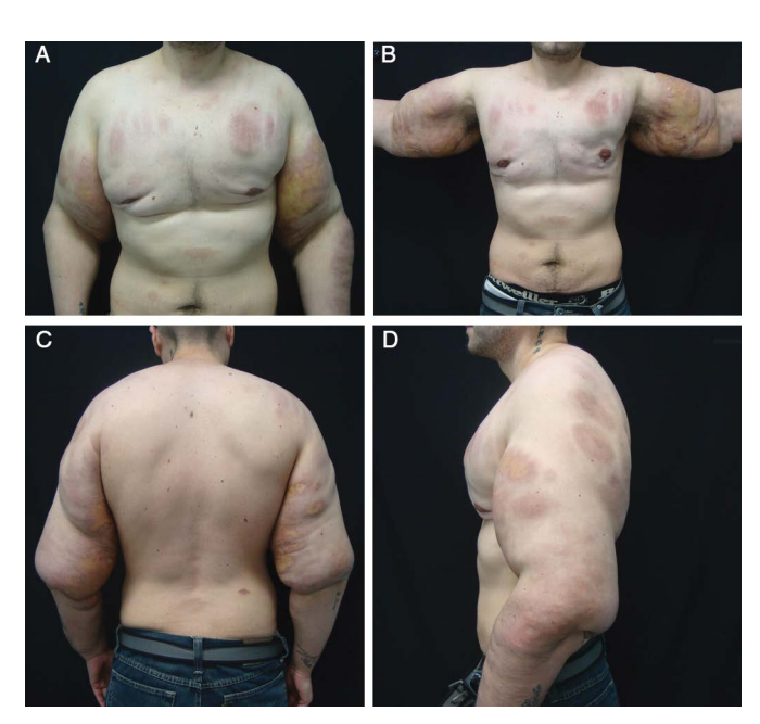
Figure 1. Preoperative appearance: Extended lesions characterized by the presence of masses, firm and irregular nodules in the subcutaneous tissue that adhered to deep planes, and violet discoloration of the skin on the upper limbs and chest. A: Frontal appearance. B: Frontal appearance with upper limbs abducted. C: Posterior appearance. D: Left profile appearance.

A 33-year-old male patient reported to have started mineral oil applications upon indication in the gym environment. He had consecutive serial applications for 3 months on the anterior chest and arms, and then suspended the application 2 years prior. Few months after the last injection, the patient already presented extended lesions in the anterior chest and arms, which were characterized as masses, and firm and irregular nodules in the subcutaneous tissue that adhered to the deep planes, in addition to a violet discoloration of the affected skin (Figure 1).