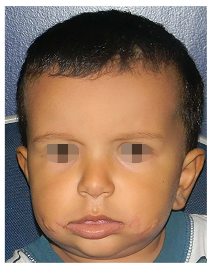
Figure 6. Two-years after correction of bilateral macrostomia.

With regard to the unilateral commissuroplasty, published data are more elaborate and the marking of the new commissure can be performed according to Mathes' method. The author used the distance between the philtrum and the commissure contralateral to the defect. This distance is then transferred to the malformed side with an overcorrection, as a scar contraction is expected.