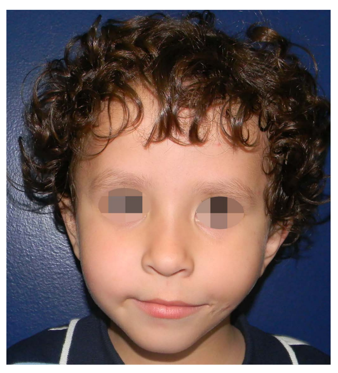
Figure 5. Five years after bilateral macrostomia correction.

recommended to correct the defect between 3 and 12 months of life to prevent impairment of the speech process<sup>4</sup>. Early intervention is advocated for patients who present pronounced nutritional deficiency. However, at 12 months, concurrent correction of other possible associated facial changes could be attained, and thus, is preferred by most authors. When macrostomia is associated with a cleft lip, the repair of macrostomia should be performed after cheiloplasty because the balance of the upper and lower lips should be taken into account in the repair of macrostomia<sup>2</sup>.