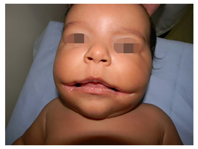
Figure 4. Bilateral macrostomia.

The pathological anatomy of this deformity is well known, but the existence of different corrective techniques demonstrates the lack of consensus as to which procedure presents the best results. It is