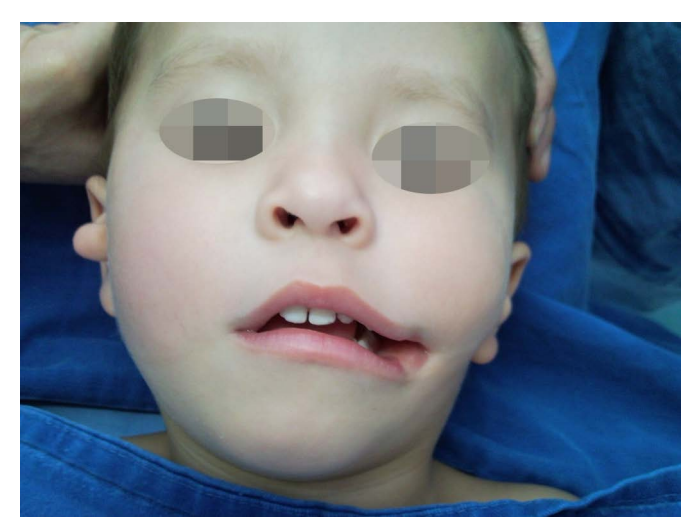
Figure 1. Unilateral left macrostomia.

Patient 1 (Figure 1): Male patient, 3 years old, presenting with hemifacial microsomia together with a left unilateral Tessier 7 cleft. Surgery was performed under general anesthesia. The marking of the new commissure was drawn by transferring the contralateral mucocutaneous zone, but with a 2-mm increase at the upper point. Infiltration with 2% xylocaine and epinephrine (1:200,000) was performed. The incision was performed on the mucocutaneous zone with dissection of quadrangular mucosal flaps, these being reversed to the oral cavity. The orbicularis oris muscle was dissected (Figure 2), reoriented, and sutured with nylon 4.0. The skin is then sutured after zetaplasty (Figure 3). Figure 3 was designed and drawn by the author.