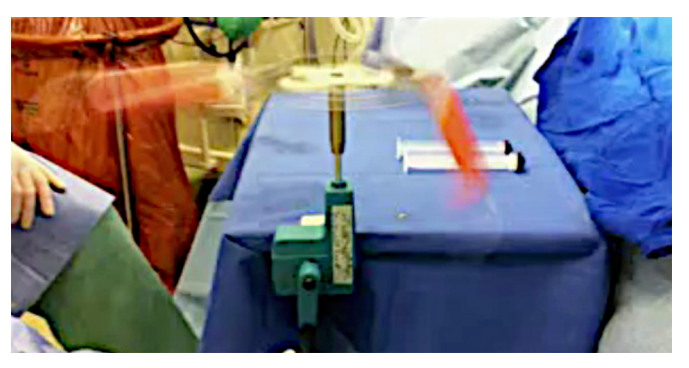
Figure 1. Manual centrifugation.

The fat obtained was centrifuged manually for 2 minutes to separate the oil, fat, and blood fractions (Figures 1 and 2).