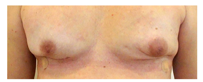
Figure 8. Bilateral adenectomy post-operatively.