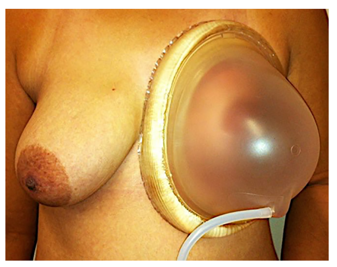
Figure 6. Use of external expansion (BRAVA®).