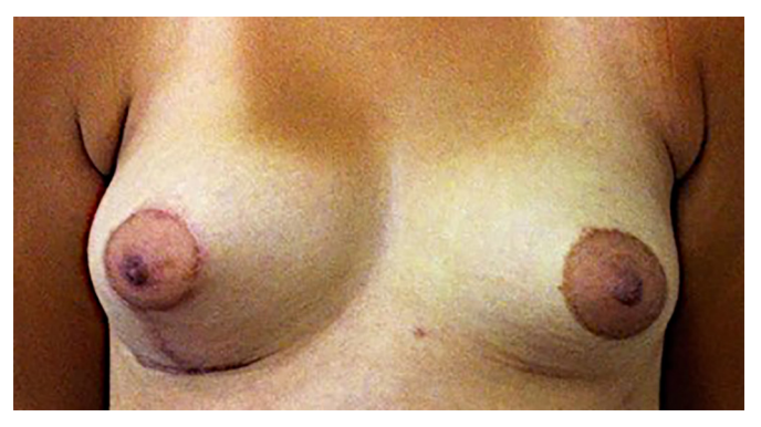
Figure 7. Fat graft in left breast (280 ml) at 6 months post-operatively and right mastopexy.

The average surgical time was 2 hours and 17 minutes. All patients had some degree of ecchymosis in the breasts post-operatively and 1 patient had an