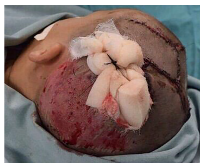
Figure 4. Supragleal flap covering the full thickness defect and partial skin graft covering the galea.