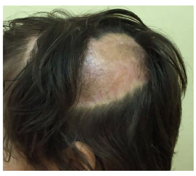
Figure 5. Final aspect after 8 months.

Vacuum dressings were introduced at the end of the 90's as a powerful tool in cases of wounds that are