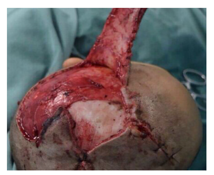
Figure 2. Supragaleal flap to cover the full thickness flap, including the area without perichondrium.