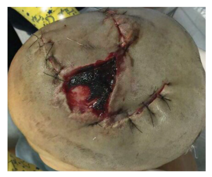
Figure 1. Residual defect after the first galea detachment surgery.

In the intraoperative, the superficial temporal artery and left occipital artery were mapped by Doppler ultrasound to design the preserved flap, preserving the main pedicles that vascularize this region, making the flap safer (Figure 2). A transposition flap was designed and dissected in the supragaleal plane, covering the full thickness defect (Figure 3). The donor area was closed with a partial skin graft, removed from the scalp, presenting excellent integration, since the galea is a good receptor area. Figure 4 illustrates the surgical procedure.