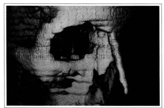
Fig. 4 - 3D-computerized tomography showing tibial bone graft surgically observed in Fig. 3.

Fig. 4 - Tomografia computadorizada em 3D mostrando o enxerto ósseo tibial observado cirurgicamente na Fig. 3.