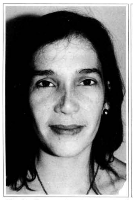
Fig. 1 - Preoperative photograph of case #1 patient, showing limits of glabella bone graft down to nasal tip.

Three clinical cases of patients victims of accident with nasal traumatism and submitted to previous treatment