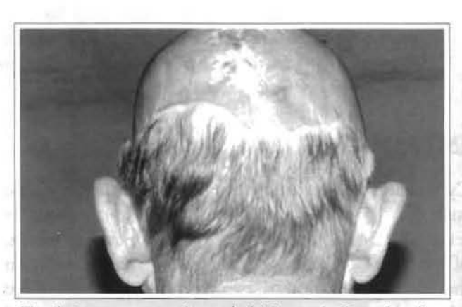
Fig. 5 - Late postoperative period (13 years) - Posterior view.