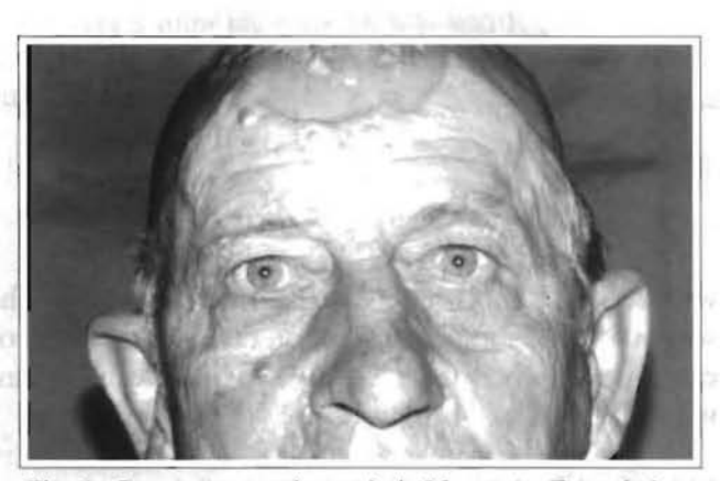
Fig. 4 - Late postoperative period (13 years) - Frontal view. Fig. 4 - Pós-operatório tardio (13 anos) - Vista frontal.