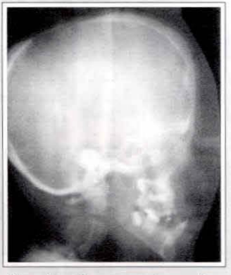
Fig. 4b - Postoperative radiograph: lengthening of the sella turcica.