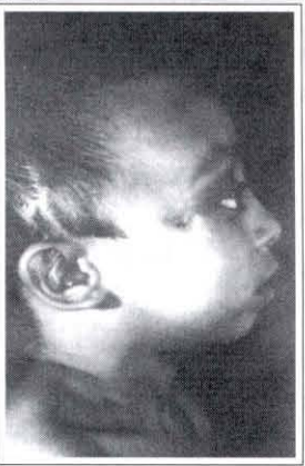
Fig. 3b - Postoperative result

Fig. 3a - Perfil pré-operatório de paciente do grupo A (Anomalia de Crouzon).