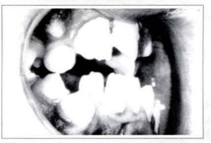
Fig. 6a - Group B patient. Preoperative occlusion (Angle's class III).

Fig. 5b - Pós-operatório, observa-se correção da exoftalmia e avanço da maxila.