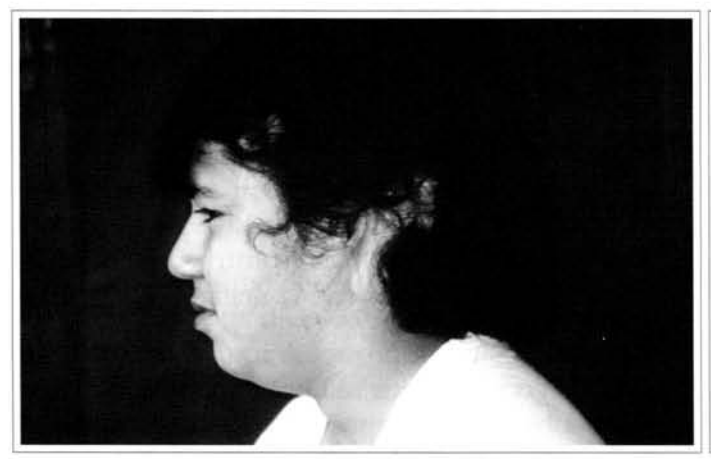
Fig. 6 - A 12-year-old patient with traumatic auricular deformity.