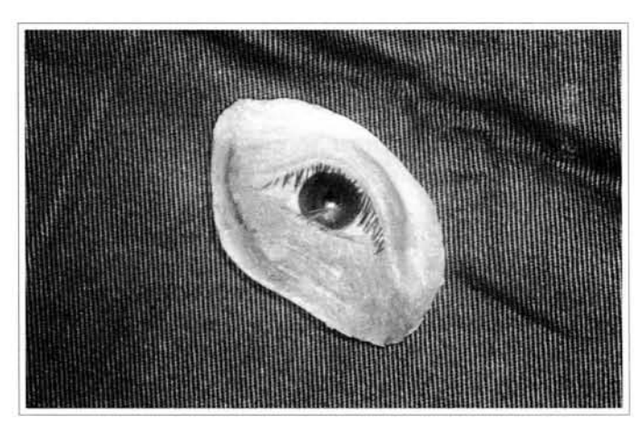
Fig. 4 - Orbital prosthesis with defined intrinsic and extrinsic coloring.