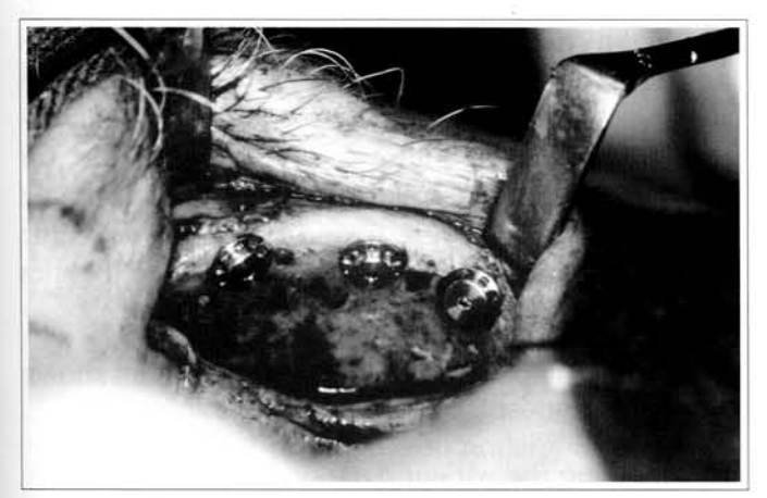
Fig. 2 – Three osseointegrated implants being inserted in the upper orbital margin ( 1^{st} step).