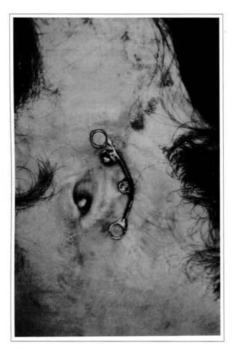
Fig. 8 - Metallic bar that supports the auricular prosthesis.