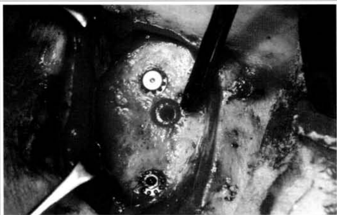
Fig. 7 - Three osseointegrated implants being inserted in the mastoid.