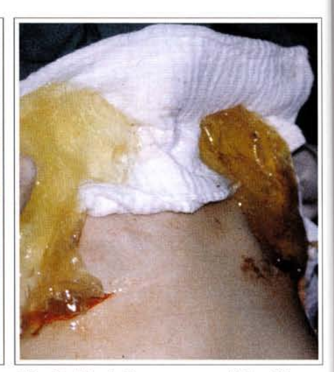
Fig. 5 – Total disappearance of the silicone prosthesis coat. The material corresponds to the filling gel.