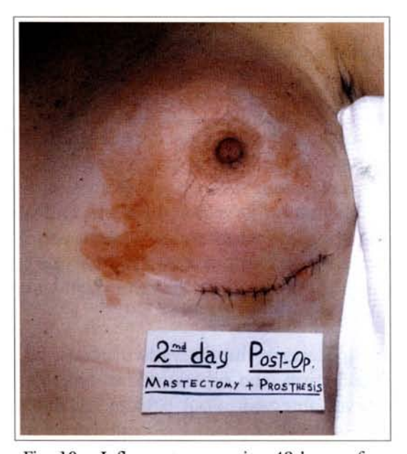
Fig. 10 – Inflammatory reaction 48 hours after the surgery. Rejection type reaction late characterized as a immunocomplexes phenomena due to chemotherapy treatment.