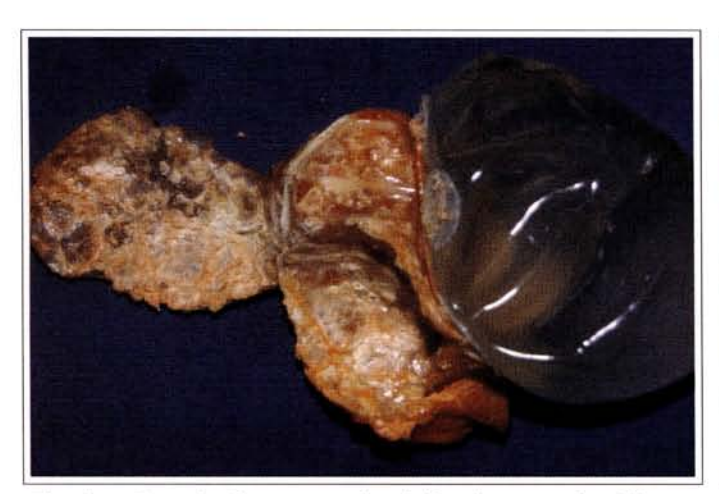
Fig. 6a - Organic fibrous capsule calcification around a silicone gel prosthesis placed 18 years ago.