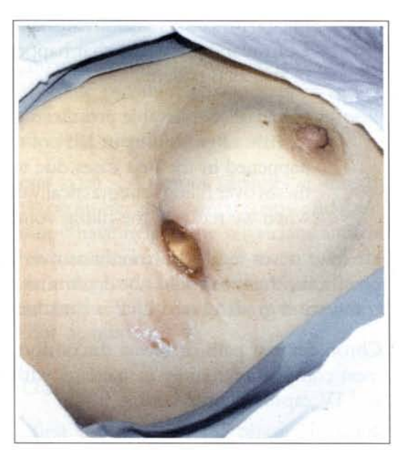
Fig. 9 - Prosthesis elimination due to infection.