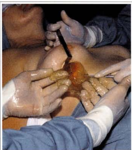
Fig. 4 – Ruptured silicone gel prosthesis. The prosthesis coat residues may be observed.