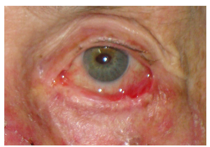
Figure 7. Preoperative period. Recurrent basal cell carcinoma at the lateral edge of the lower eyelid (patient 3).

The patients had no complications except for a dot granuloma, which was removed under local anesthesia, and a temporary asymptomatic retraction of the upper eyelid. The functions of total closure and protection of the eyeball of the eyelids were maintained. Scar retraction, ectropion, entropion, or lagophthalmos was not observed. The aesthetic result was very satisfactory, with discrete scars in the donor and recipient areas (Figures 7 and 8).