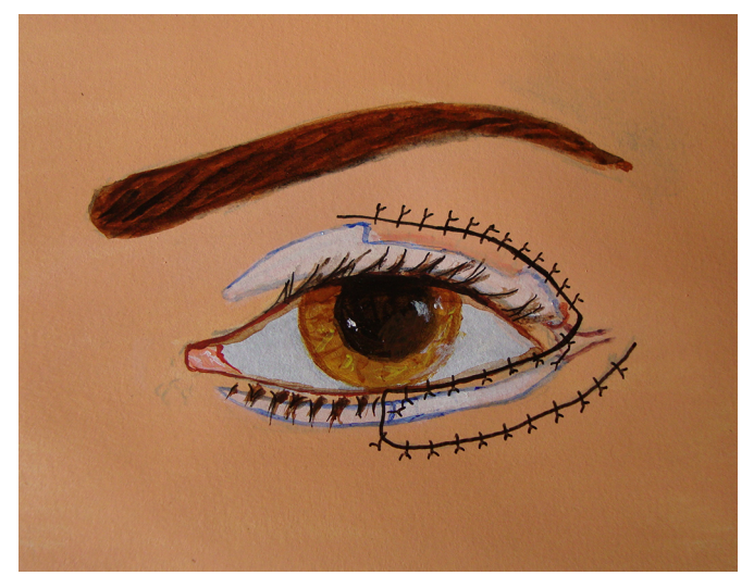
Figure 3. Final appearance after surgery.