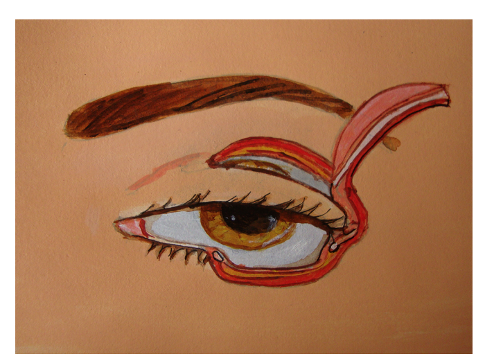
Figure 2. Flap transposition.