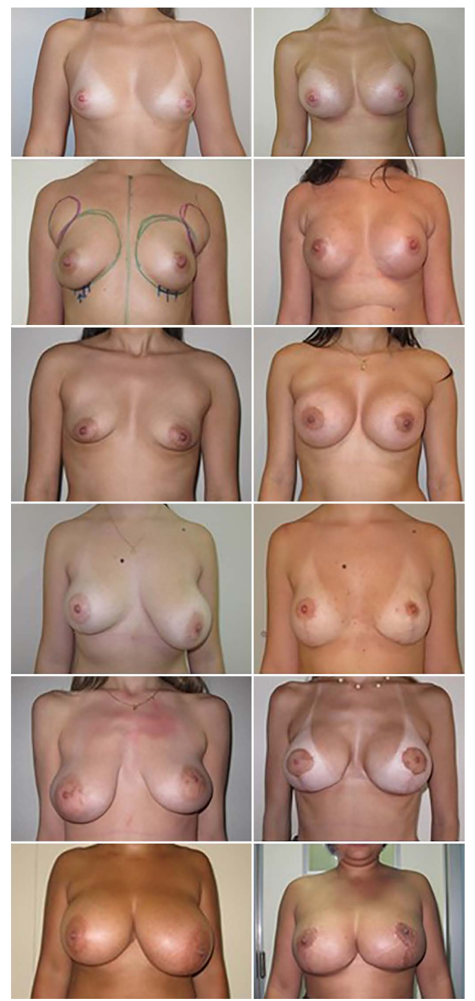
Figure 3. Clinical cases of breast asymmetry with their classification and surgical treatment.

Figure 3C shows another example of type 2 asymmetry, but asymmetry predominated in contour and mammary fold. In this case, it was decided to keep the same prosthesis textured, 330ml extra high Silimed (subfascial plane), mammary fold lowering, and fat grafting of the lower poles of both breasts.