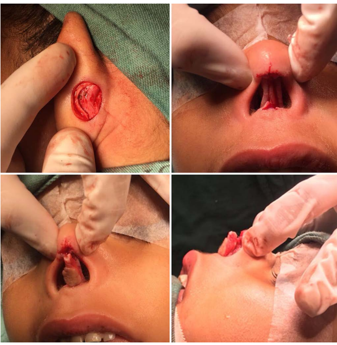
Figure 4. Posterior auricular chondrocutaneous grafting.

The patient did not have any complications and was discharged from the hospital on the 1st postoperative day. The surgical wound showed no signs of complication, with a good appearance. The patient returned for outpatient follow-up and the graft was 100% vital (Figure 6). She will remain in follow-up until adolescence, to assess the need for re-approach for aesthetic refinement.