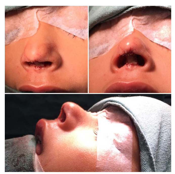
Figure 5. Immediate postoperative.