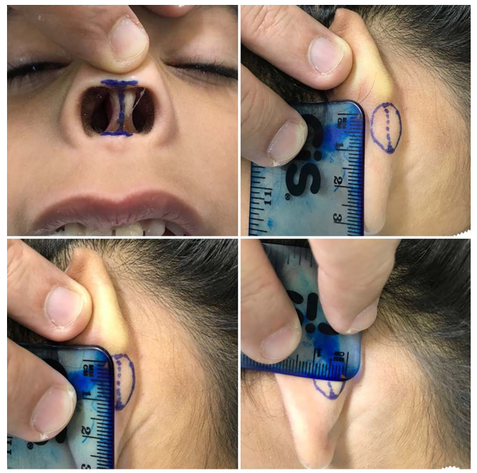
Figure 3. Surgical marking.