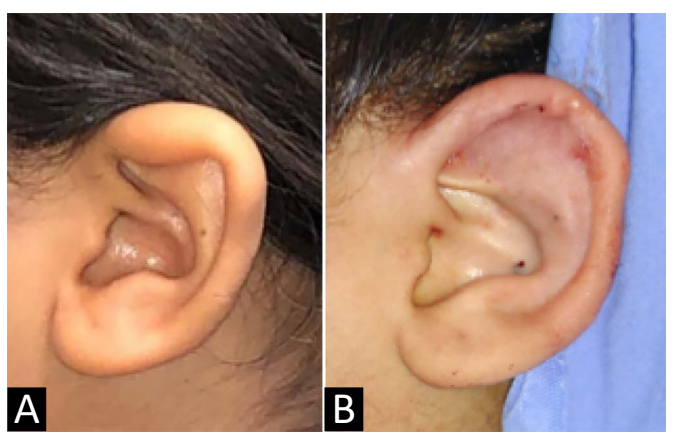
Figure 3. A. Preoperative appearance; B. Immediate postoperative appearance.

Sewing of Mustardé stitches (1963)<sup>4</sup> with nylon 4-0 in order to demarcate anti-helix and stitch in anti-tragus until the concha for lobe adduction (Figure 3).