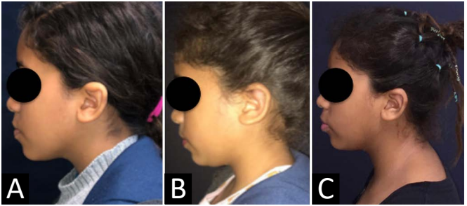
Figure 4. A. Preoperative appearance; B. Postoperative appearance in 30 days; C. 6 months postoperative appearance.

Results can be seen 30 days after the operation and complete healing within six months of surgery (Figure 4).