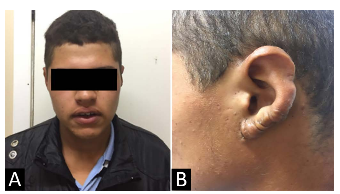
Figure 3. A. Sixth month after surgery. B. Sixth month after surgery.