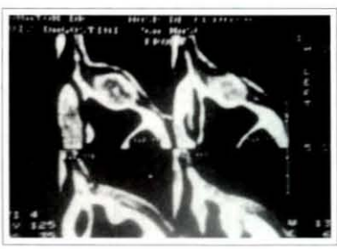
Fig. 2 - CT showing invasion of maxilar sinus.