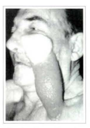
Fig. 4 - Correction after MCF rotation.