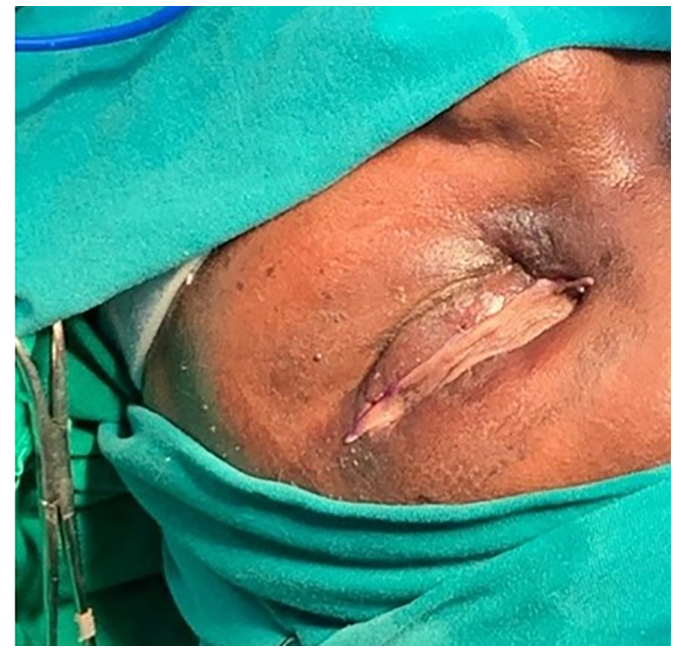
Figure 5. Second stage of eyelid reconstruction with cutaneous autografting.

After 15 days of the initial surgery, cutaneous self-grafting of the upper eyelids was performed, with the left arm's inner face as the donor area (Figure 5).