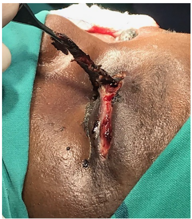
Figure 3. Surgical debridement of the necrosis area.

The upper eyelid defects were covered with a PELNAC® dermal regeneration matrix (Figure 4).