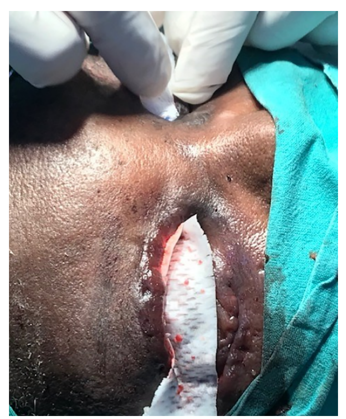
Figure 4. Palpebral reconstruction with dermal matrix.

The upper eyelid defects were covered with a PELNAC® dermal regeneration matrix (Figure 4).