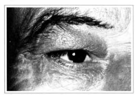
Fig. 4. Postoperative aspect.