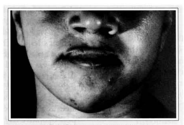
Fig. 13: Abbe's flap (postoperative view). Fig. 13: Retalho de Abbe (pós operatório).

3rd Abbe's flap: First described by Robert Abbe, the rotation flap, which uses tissues from the lower lip to correct upper lip deformities, has as accurate indication the correction of lip deformities caused by bilateral clefts; nowadays, however, it is used also for the correction of sequelae caused by unilateral lip cleft, filter deformities, absence of median tuberculum, etc. (Millard<sup>5</sup>). For this method application, 4 patients with sequelae from bilateral lippalate clefts were selected; those patients presented severe cicatricial retractions which involved lip skin and mucosa, intense reduction of the gingivolabial sulcus and a great impairment of the upper lip mobility. The patients were submitted to surgery with local anesthesia, in a way similar to the methods previously described. The surgical procedure was limited to the marking of the resection area on the upper lip and flap of the lower lip; the whole fibrotic tissue was resected, as far as the spot next to the columella base. The upper orbicular muscle was