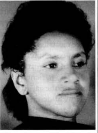
Figs. 10 & 12: Abbe's flap (pre & postoperative view). Figs. 10 e 12: Retalho de Abbe (pré e pós operatório).