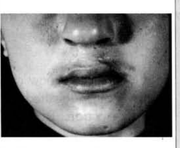
Figs. 1 & 3: Dermal-adipose graft (pre & postoperative view). Figs. 1 e 3: Enxerto dermo-gorduroso (pré e pós operatório).