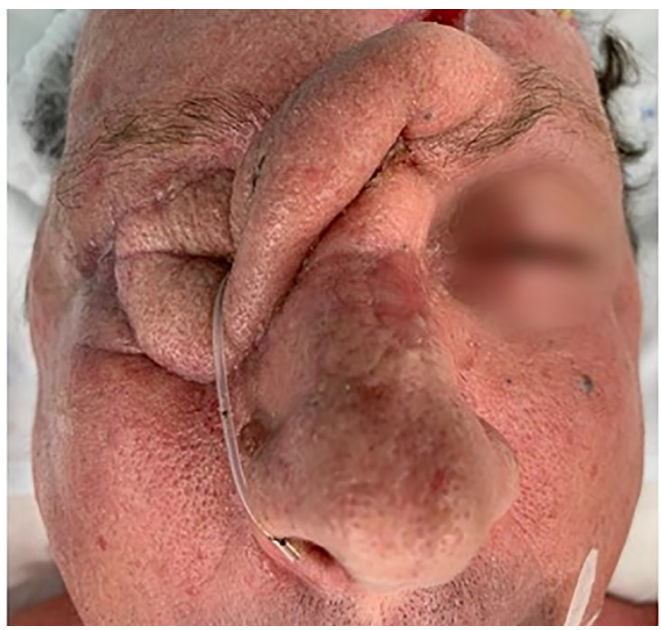
Figure 3. Frontal flap positioned with a central incision that mimics the eyelid rhyme.

Finally, to restore the outermost layer and cover the previously described structures, a contralateral frontal flap was made "in mask" to mimic the eyelid rhyme's opening, with anti-clockwise rotation (Figure 3).