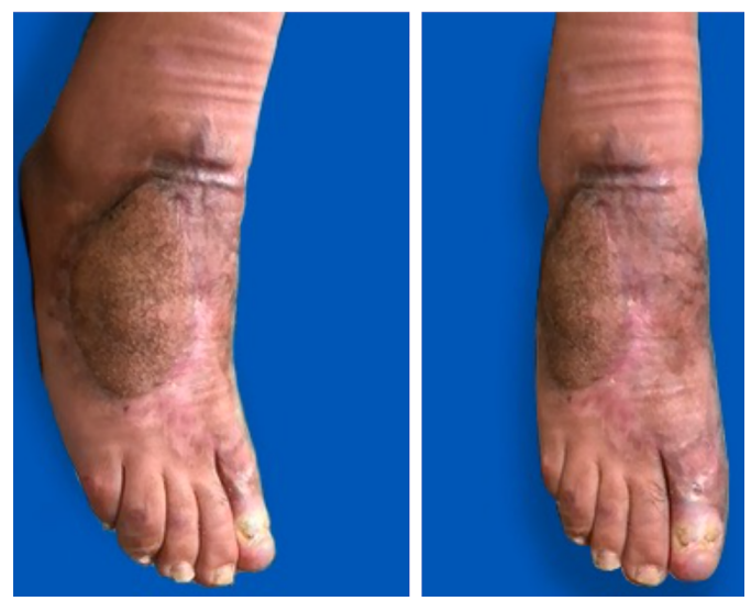
Figure 5. Postoperative after 5 months of follow-up.

dimensions to cover the entire lesion ( 12 \times 8 \text{ cm} ), without excessive traction of the pedicle, with the skin island being drawn in the middle and proximal third