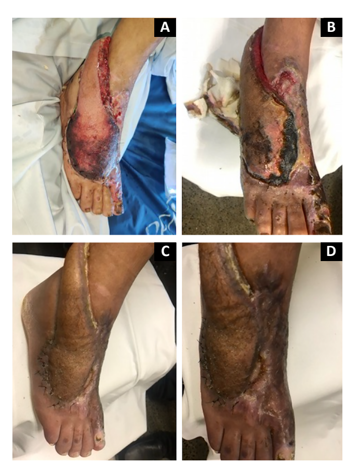
Figure 4. A: Distal congestion of the flap (5th postoperative day). B: Delimitation of flap necrosis (20th postoperative day). C and D: Debridement and re-advancement of the flap (2nd postoperative month).