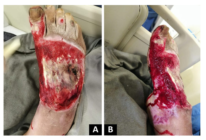
Figure 1. Right foot injury. A: Top view. B: Medial view.

amputation by the Vascular Surgery team. In treating the other injuries, he underwent serial debridement in the contralateral limb, resulting in a defect on the right foot's medial face, hallux, and entire dorsum, with bone exposure (Figure 1).