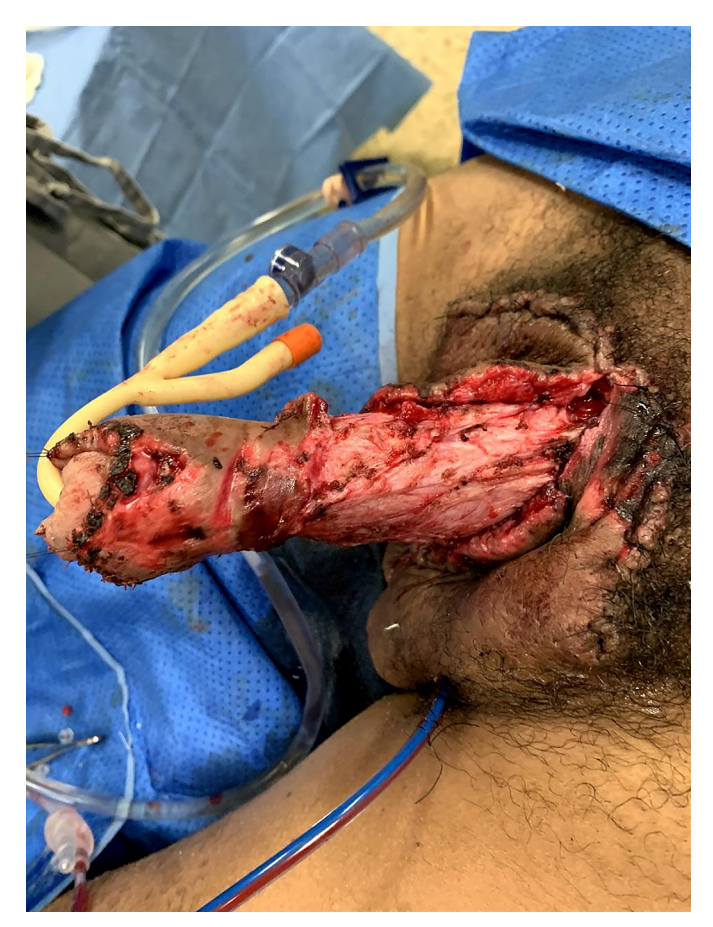
Figure 6. Surgical debridement of a necrotic area, with identification of Buck's fasciae.

in its ventral midline. A new dressing was performed with petrolatum gauze + sterile hydrophobic cotton, maintained for five days.