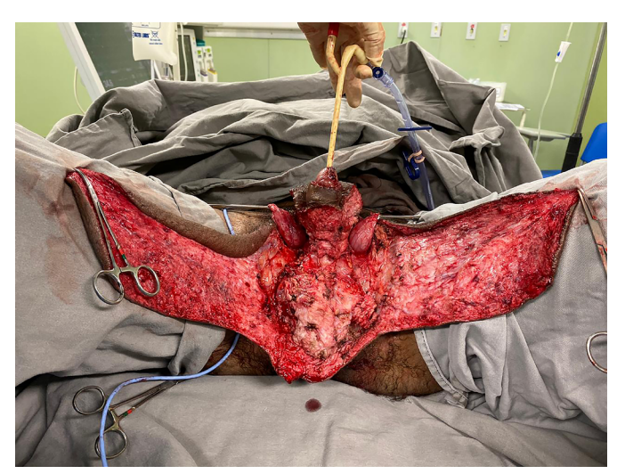
Figure 3. Exposure of parascrotal flaps after removal of excess tissue.