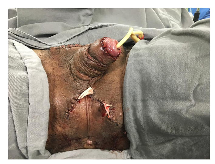
Figure 4. Synthesis of the flaps for making the new scrotum.

the third postoperative day (POD). The drains were removed on the 5th POD after a flow rate of less than 30ml in the previous 24 hours. On the 7th POD, a fetid, greenish secretion was coming out of the ventral portion of the penile suture; secretion cultures were collected, suture stitches were removed alternately, and empirical antibiotic therapy was started (ceftriaxone + gentamicin). Dressings were changed at shorter intervals (8h).