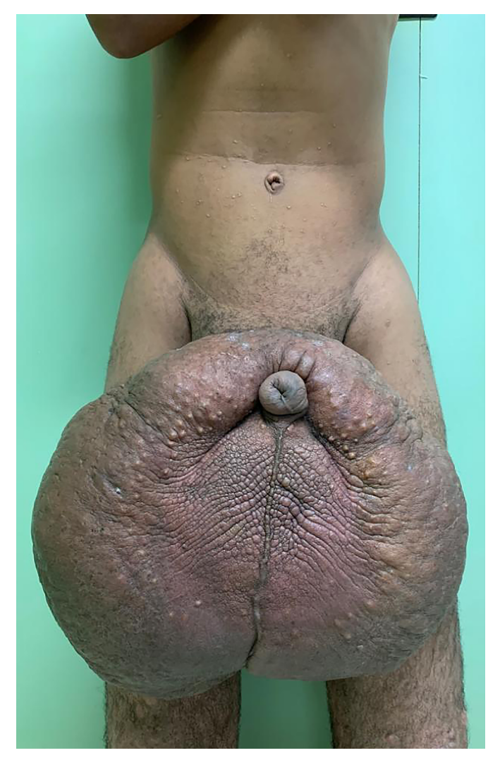
Figure 1. Patient presentation.

This was followed by the subdermal dissection of two parascrotal flaps in the transition with healthy skin (24cm x 10cm) and an inverted "V" perineal flap (7cm), with subsequent excision of the scrotal excesses (Figure 3). The parascrotal flaps were bipartite, the