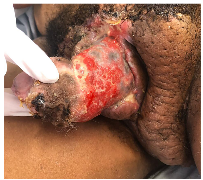
Figure 7. Granulation tissue in the penile body.

He was discharged on the 25<sup>th</sup> DPO, with serial returns at 15, 30, 60 and 120 days. The patient presented voluntary urination with satisfactory voiding control and a non-painful, functional erection with preserved ejaculation. Aesthetically, the final result was poor, with dorsolateral scars on the penis, hypertrophic scars in the pubic region and deviation of the flaccid penile shaft to the left by 90° in the axial plane (Figure 8). The patient, however, chose not to perform new approaches, reporting being satisfied with the results.