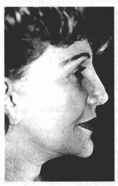
Fig. 2d - Postoperative. Fig. 2d - Pósoperatório.

cranio-caudal direction. Over the muscle, sharp dissection is performed up to the zygomatic arch, keeping the deep medial temporal artery intact. After the flap has been flipped 180° over the zygomatic arch, it is fixed to the fascial fatty tissue of the nasolabial fold in a line that is an imaginary level which goes from the subtragion up to the lateral inferior aspect of the nasal alae (Fig. 1b). Fixation is accomplished using 4-0