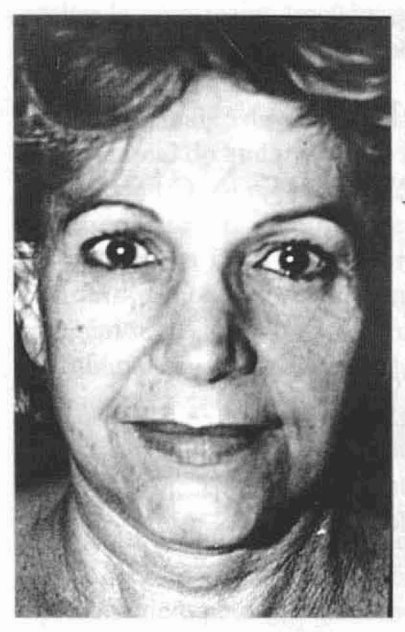
Fig. 2a -Preoperative; facial corrugations. Fig. 2a - Préoperatório; rugas faciais.

Fig. 2b - Postoperative. Fig. 2b - Pósoperatório.