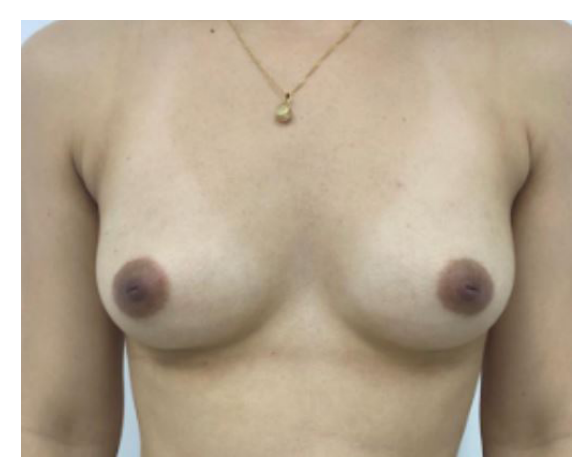
Figure 3. Preoperative view of a patient undergoing primary subfascial breast augmentation.