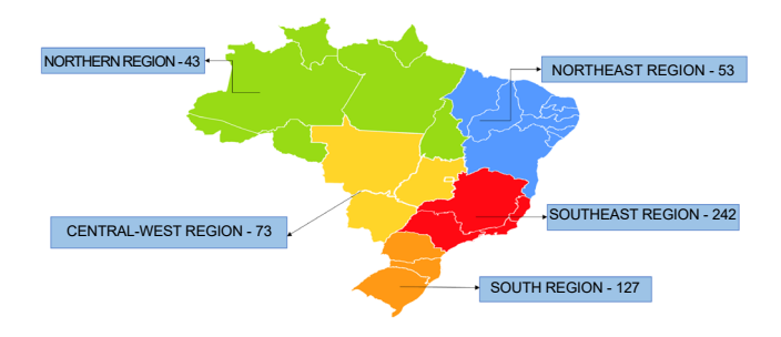
Figure 2. Potential Cosmetics Consumption Index.