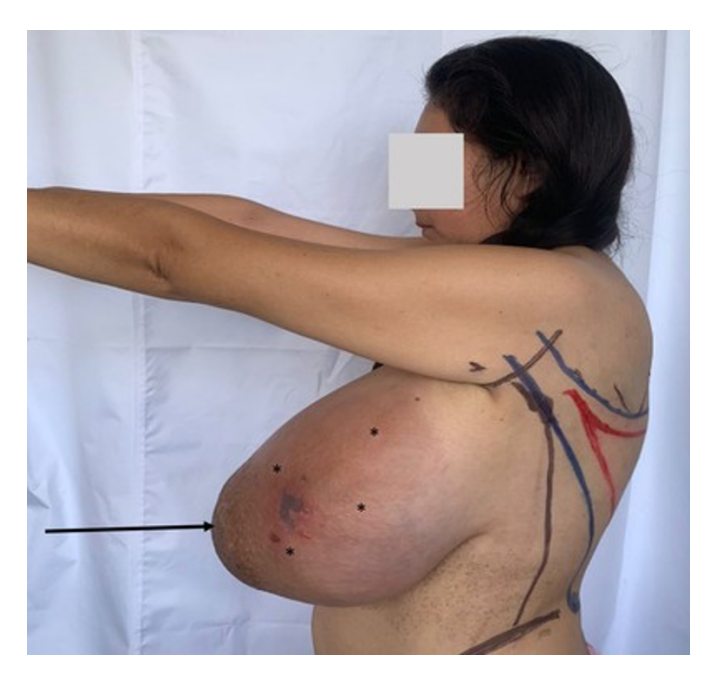
Figure 1. Giant PT of the left breast (arrow) that occupies the entire left breast volume and respects the mammary sulcus. There is evidence (*) of abundant collateral circulation, extensive erythema and diffuse circular areas of violaceous coloration.

The findings found in the ultrasound study were compatible with the BI- RADS2 category, describing a vascularized, predominantly solid tumor with well-defined margins and cystic foci of approximately 15 cm. There was no evidence of distant metastases on