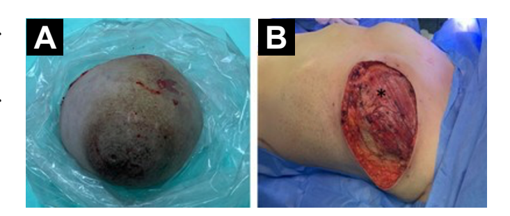
Figure 2. A: Mastectomy specimen in which the tumor is included. B: Left mastectomy with radical resection of the PT, showing (*) aponeurosis of the pectoralis major.

Because of the findings, it was decided to perform a left total mastectomy plus immediate breast reconstruction. The left total mastectomy was performed by the Gynecologic Oncology Service. Initially, a low axillary dissection and a Steward incision were performed, then an upper flap was formed with the inferior clavicular border as limit, and an inferior flap with the sub mammary sulcus, the anterior border of the latissimus dorsi and the sternal border as limits. Subsequently, the tumor tissue of the left breast was excised, dissecting down to the aponeurosis of the pectoralis major (Figure 2).