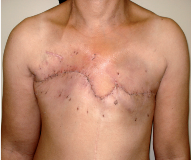
Figure 4 – The scar 3 weeks after the operation.

procedure, we performed aspiratory drainage using a Portovac 3.2 drain, which was removed after seven days. After completion of the procedure, the patient neither complained of pain nor experienced suture dehiscence or any other complication (Figure 4).