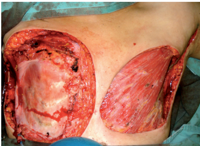
Figure 1 – The wound following bilateral hygienic mastectomy.

By following this procedure, we achieved wound closure after three cycles of traction. During the approximately two-hour