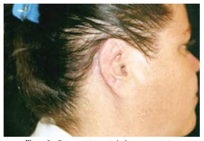
Figure 9 – Postoperative period after reconstruction of the right ear.