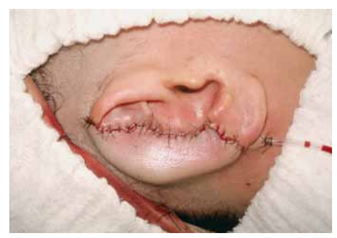
Figure 12 – Immediate postoperative period with retroauricular flap covering the graft.

According to the standard technique, the form of the contralateral ear was replicated using reversed radiography film; the ear cartilage was reconstructed using cartilage removed from the eighth or ninth ipsilateral costal arc (Figures 10 to 12). Both donor and recipient areas of cartilage were subjected to vacuum drainage. During the second surgery, a total skin graft removed from the inguinal region was placed, and a Behind-the-ear hearing aid (BTE) model (developed by JCS) was used for 6 months when required to avoid scar retraction in cases of reconstructions after major cartilage loss. BTE models are made of 12-mm Plastazote sponge with Velcro (Figures 13 and 14).