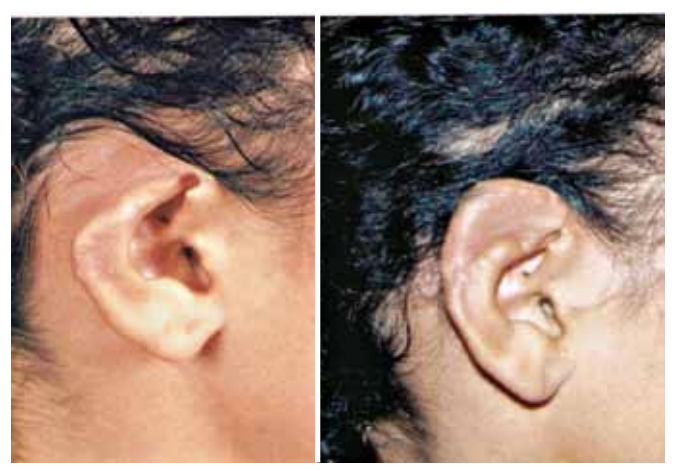
Figure 1 – Pre- and postoperative periods of reconstruction of the upper pole of the right ear after traumatic injury.

A total of 34 patients were analyzed: 14 (41.1%) women and 20 (58.9%) men with a mean age of 33.2 years (range, 13–56 years) (Figures 1 to 3). One patient underwent simultaneous reconstruction of both ears using only costal arc cartilage (Figures 4 to 9).