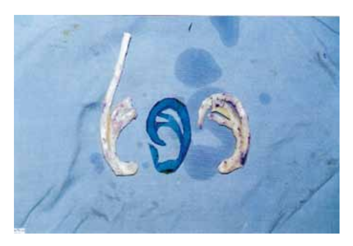
Figure 7 – Split and shaped costal cartilage for simultaneous reconstruction of both ears.