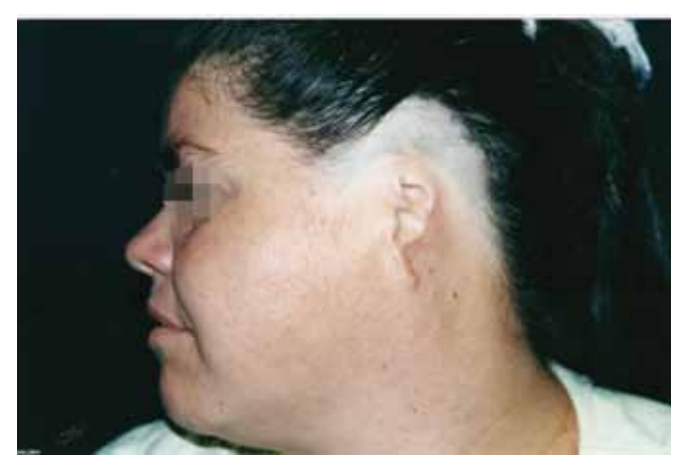
Figure 4 – Preoperative period of a patient with traumatic loss of the left ear.