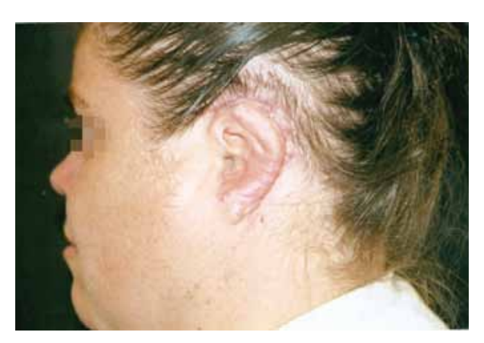
Figure 8 – Postoperative period after reconstruction of the left ear.