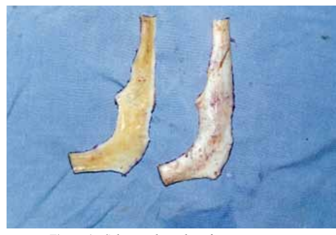
Figure 6 – Split costal cartilage for reconstruction of both ears.