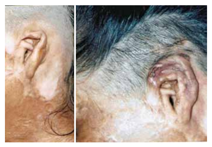
Figure 2 – Pre- and postoperative periods of reconstruction of the left ear after traumatic injury due to burns.