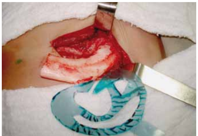
Figure 10 – Intraoperative period: removal of costal cartilage and shape of radiography film marking the size of the graft required for reconstruction.