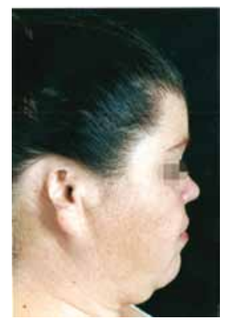
Figure 5 – Preoperative period of a patient with traumatic loss of the rigth ear.