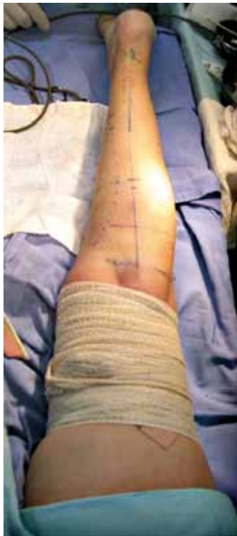
Figure 2 – Detail of the limb (patient 5) with proximal compression after applying an Esmarch bandage.

A skin incision was made and extended into the subcutaneous tissue, and dissection was performed in the caudal