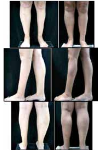
Figure 3 – Patient 5. Before (left pictures) and 3 months after (right pictures) silicone implant insertion, 120 ml medially located and only in the left leg.