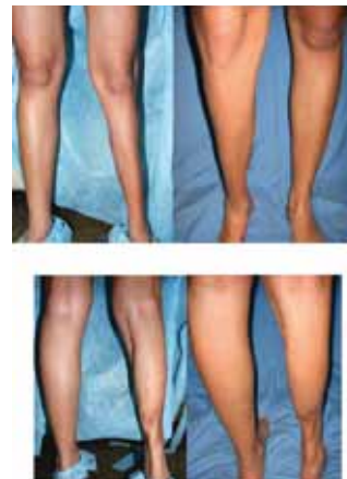
Figure 5 – Patient 4. Before and after silicone implant insertion (120 ml), showing the medial gastrocnemius of the left leg.