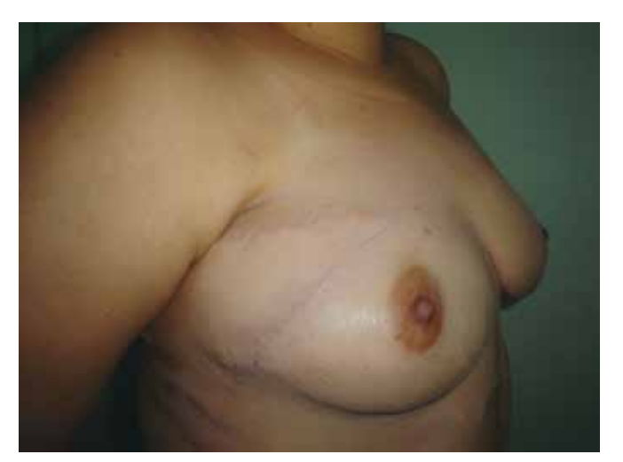
Figure 10 – Final result: oblique and right views six months postoperatively.