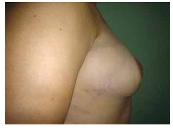
Figure 11 – Final result: profile and right views six months postoperatively.