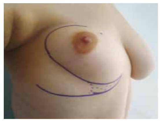
Figure 4 – Preoperative aspect with design of flaps from the first surgical procedure.

The main surgical steps are illustrated in Figures 5 to 9. These three surgical steps were performed at