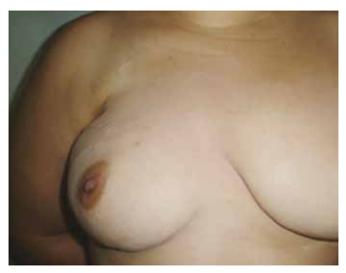
Figure 13 – Final result: frontal view six months postoperatively.

Transposition flaps and rotations are widely used in reconstructions of both the mammary gland and the chest wall. In the case reported herein, after flap rotation, the marking resembled a "Z" of the classic Z-plasty and Holmstrom's